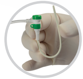
Enhanced kink resistance for optimal procedural reliability

CUSTOM KIT OPTIONS - Merit can tailor kits to meet your clinical needs.