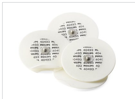
40493D / 40493E