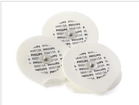
M4612A / M4613A