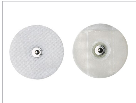
13941E / 13942E